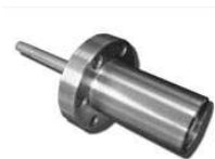
Interlock Fischer HV feedthrough

The safety interlock feature requires two ground connections from the pump to the controller, for the high voltage to operate. The primary ground is made by the braided shielding of the coaxial cable. It connects the controller chassis ground to the pump body through the cable connectors. The second ground is made by an additional wire inside the outer cover of the coaxial bundle. This second ground makes contact to the pump by a ring of fingers inside the Interlock Fischer HV feedthrough, which are connected to the pump through the body of the feedthrough. There are two insulated pins inside the Fischer cable connector, which connect the secondary ground wire to the ring of fingers, when the Fischer connector is plugged into the feedthrough.