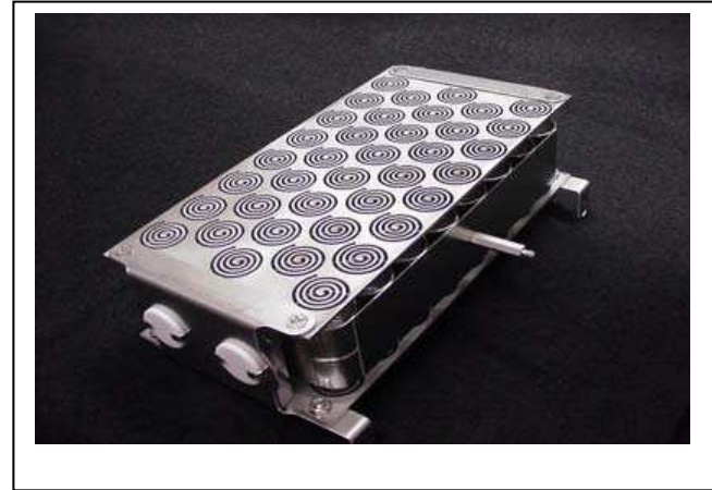
Fig. 2 Galaxy Diode Element

Accelerated and extrapolated lifetime tests with air and argon indicate that the lifetime Of the Galaxy elements is in the same range quoted for other ion pump element technologies, i.e. 40,000 to 50,000 hours at an operating pressure of 1 \times 10^{-6} mbar. Galaxy elements plus new and rebuilt ion pumps are available.