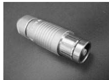
Varian-Style Interlock Connector